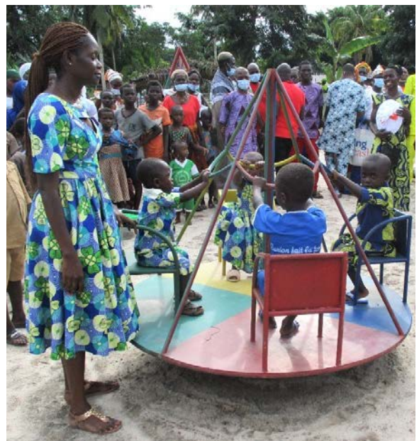
CACE: Community Action Center for Children in Baleyo, Côte d'Ivoire