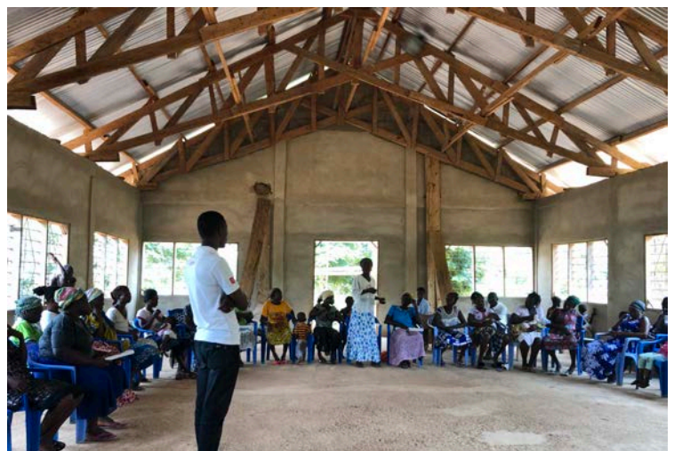
TRAINING sessions across cocoa, coffee and ingredients supply chains